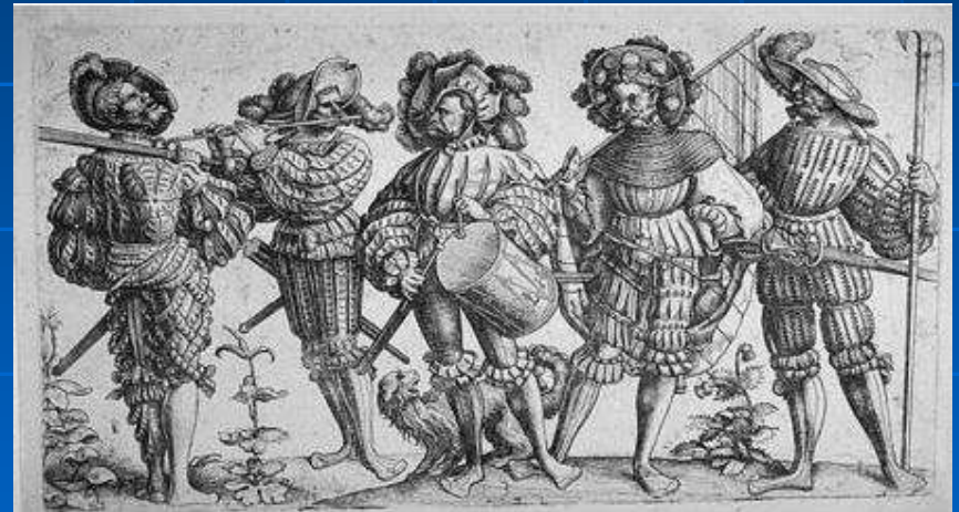
15 th Century Landsknechte